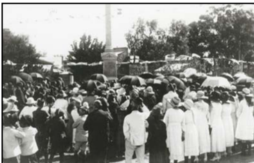
Unveiling the Laura War Memorial 17 Dec 1921