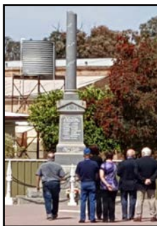
Remembrance Day 11th Nov 2016