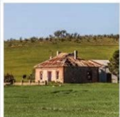
Mid North Local Health Cluster

This year marks the Club's 50 th Anniversary and we intend to celebrate at a special Lunch in Wirrabara Hotel on 15 th November, combining it with our annual Christmas meal. Tell you all about it next issue.