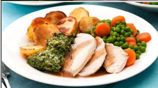
Thursday Night Roast $10.00

Open: Monday to Thursday 7am—6pm Friday 7am—8pm Saturday 8am—8pm Sunday 8am—6pm