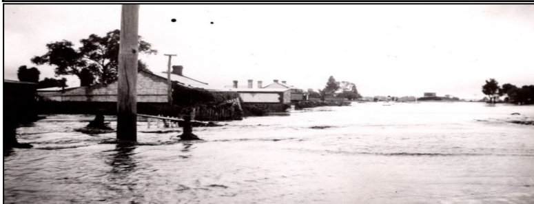
Picture Left The 1941 flood

Picture Page 17 Looking towards Tom Catt Hill and the Catholic Church