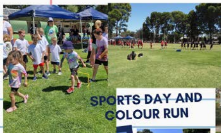
SPORTS DAY AND COLOUR RUN