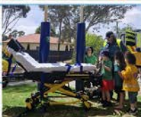
YR.6 STUDENTS PARTICIPATED IN MASTERMIND