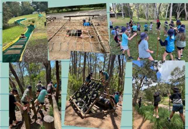
WOODHOUSE ADVENTURE CAMP FOR THE YR2-YR6 STUDENTS

STUDENTS REPRESENTED L.P.S AT SAPSASA CRICKET AND TENNIS