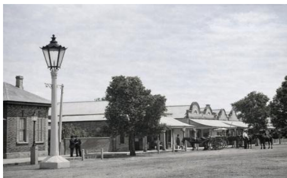
Laura, from ‘Sunny South Australia’, (published 1908).